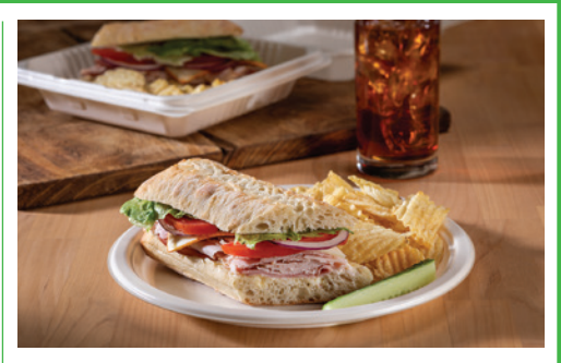
Bio-based Rigid Industrial Compostable (certification pending ) Plates, Bowls and Hinges Compartments: 1, 3

Bio-based Straws Home and Industrial Compostable Diameters: Jumbo and Giant Lengths: 7.75", 8.5" and 10.25" Colors: Clear, Emerald and Ruby