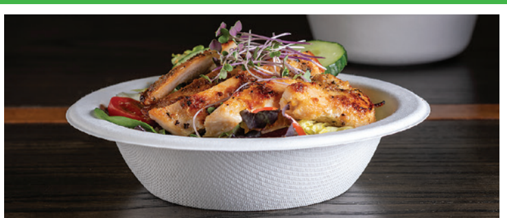
Molded Pulp Industrial Compostable Plates, Bowls and Hinges Compartments: 1, 3