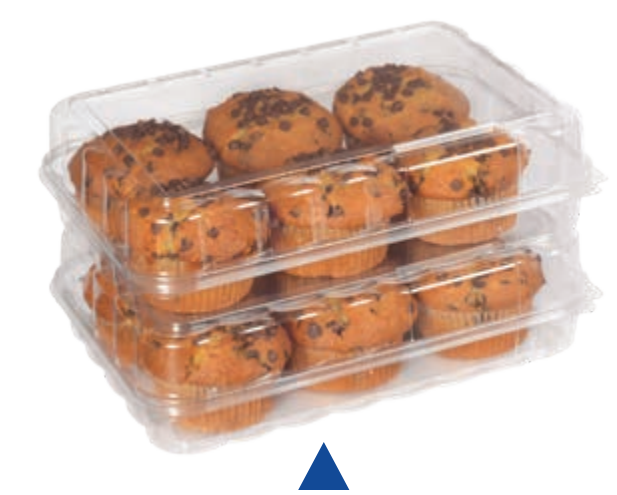
Scalloped sides beautifully accommodate popular pastry sizes and shapes