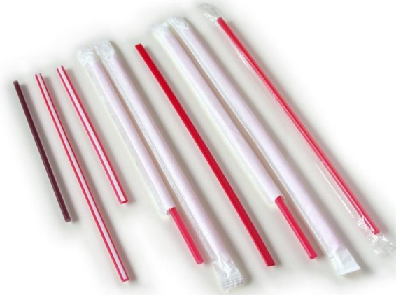
Coffee Service Stirrers and Straws