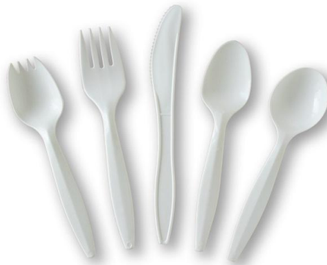
Elite Brand Medium weight Polypropylene