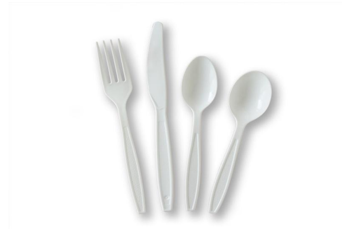
Advantage Brand Full Size Heavyweight Polystyrene and Polypropylene

Most cutlery can be purchased in bulk, wrapped, or in convenient dining kits. Most cutlery is available in white, black, with our Full-size Advantage (PS) also available in Champagne. See specific product descriptions for full offerings.