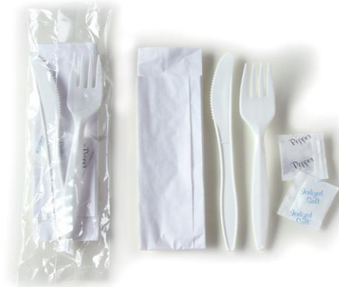
Dining Kit with Napkin and Seasonings in White