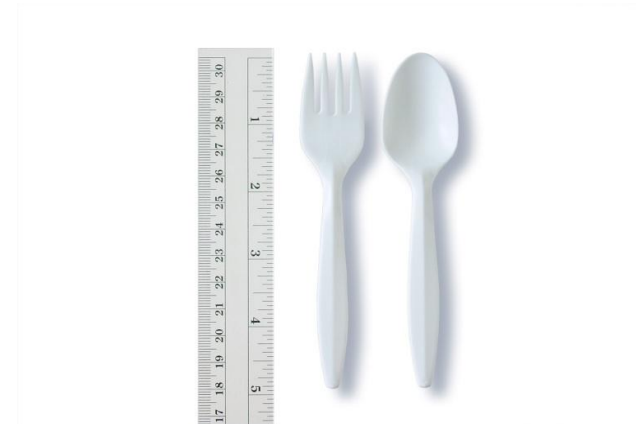
Challenger Brand Lightweight Polypropylene

Organizations who desire functional, good-looking medium weight cutlery should consider our Elite polypropylene line. You'll find this cutlery at quick serve restaurants, party stores, hospitals, and take-out establishments.