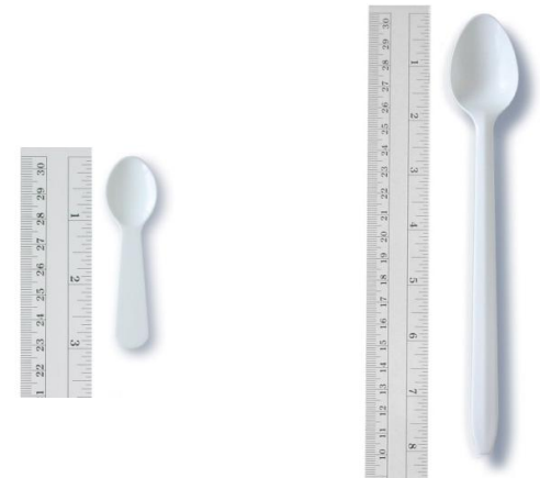
Specialty Taster Spoon