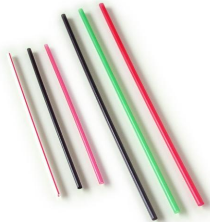
Bar Service Stirrers and Sippers