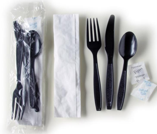
Dining Kit with Napkin and Seasonings in Black

We offers three piece Dining Kits . Custom dining kits with a wide variety of options are available.